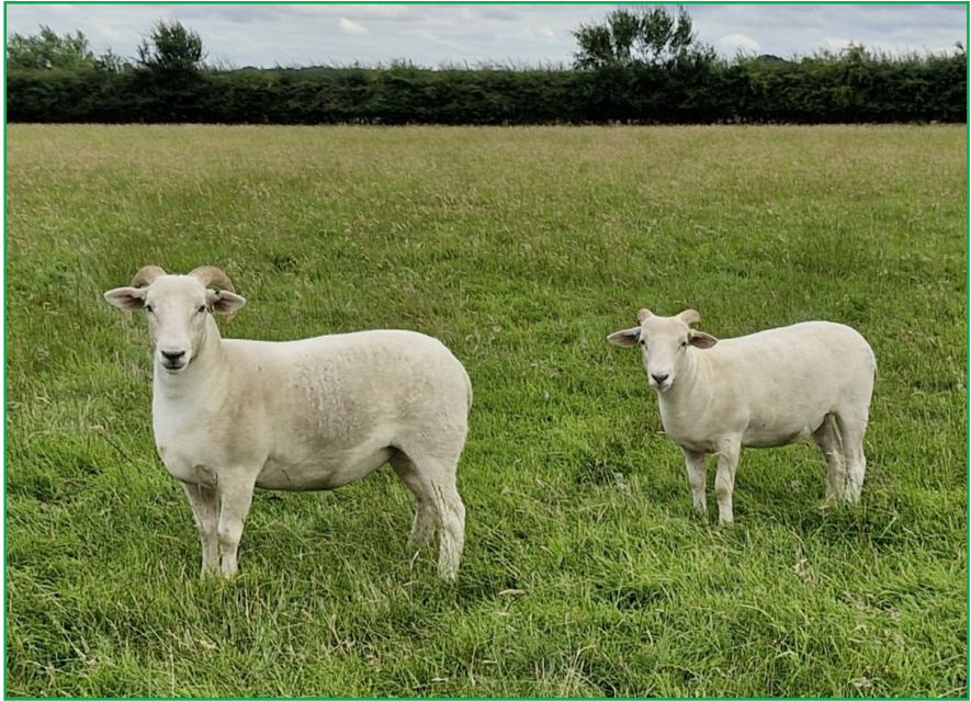
Lot No. 34 Souldrop F57231 & Lot No. 102 Souldrop F58455 Other lots entered 32, 33, 103, 104 & 105