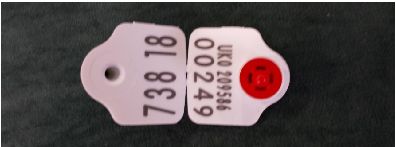
2. Combined DEFRA & WHSS tag