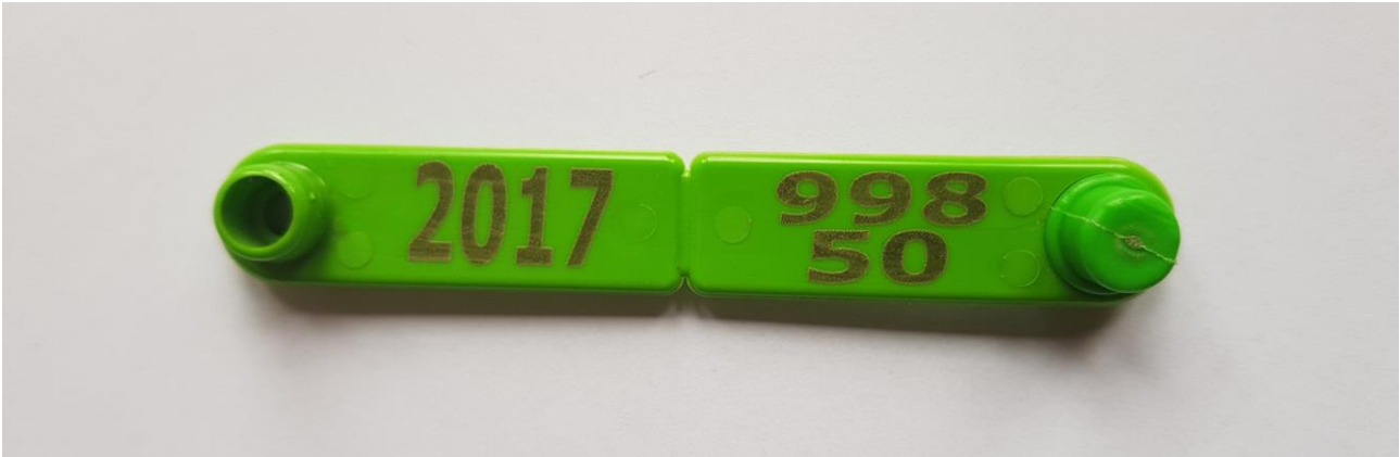
1. Dedicated WHSS tag

Samples of ear tags that are acceptable to the WHSS. Please note that these examples are not exhaustive and other tags will be equally acceptable providing they meet the requirements defined above.